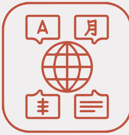
Linguistic and cultural diversity