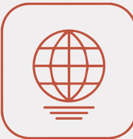
Secure, stable and resilient networks