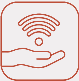
Digital access for all