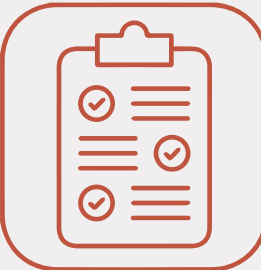
Universal standards and regulation