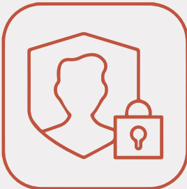
Personal safety and data privacy