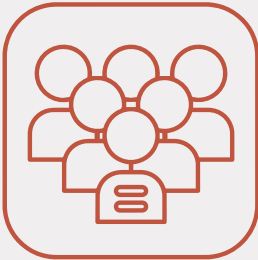
Universal and equal rights

To inform our advocacy through AUDRi, we used evidence from our consultations with organizations including Amnesty International, the Danish Institute for Human Rights, the Web Foundation, and POLLICY to formulate the following nine universal digital rights standards, each underpinned by an intersectional feminist, anti-discrimination analysis: