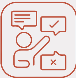
Freedom of expression and association